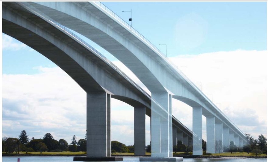
The Gateway Arterial project features a major tolled crossing of the Brisbane River with feeder roads to the north and south comprising a total of 20km of expressway.

West Australia Main Roads (WAMR) has embraced the concept of using DRBs. The commissioner was previously with WA Water and was largely responsible for inclusion of DRBs in the two major dam contracts constructed by WA Water and referred to under Australian experience pre DRBA. As yet no WAMR contracts have been awarded with a DRB included. In addition, the WA group are working on several possible opportunities for DRBs in the oil and gas area.