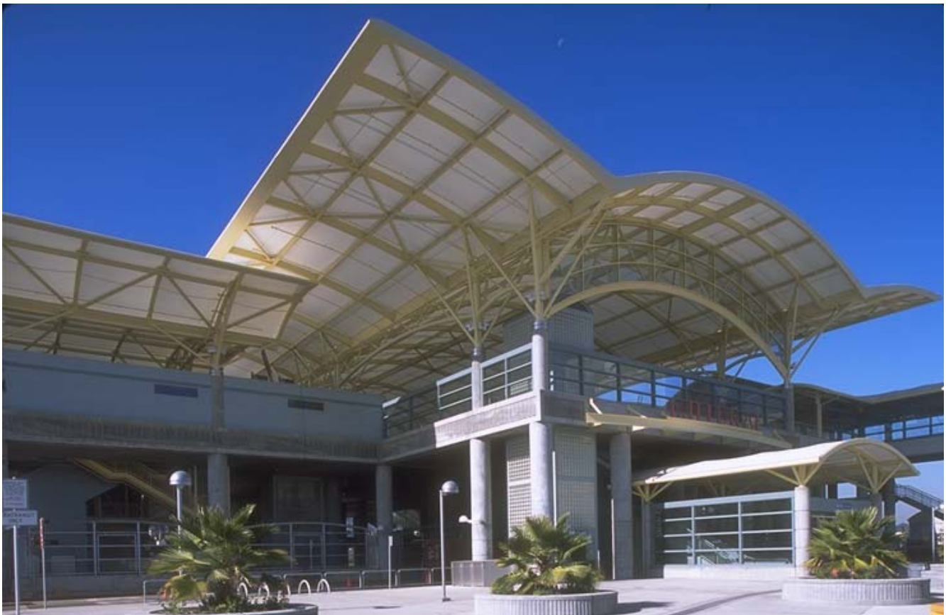
The Millbrae BART Station, part of the SFO Extension completed and put into operation in June of 2003.